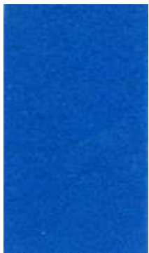
Ref. 1009 - AZUL DUCADOS