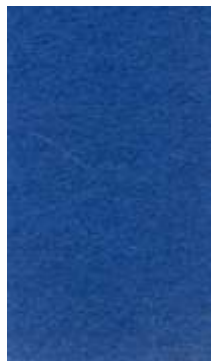
Ref. 1010 - AZULÓN