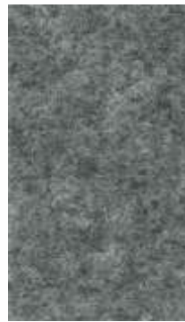
Ref. 1004 - GRIS JASPE