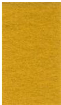
Ref. 1027 - ORO