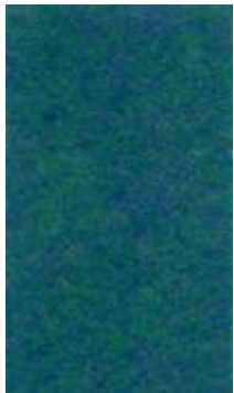
Ref. I042 - VERDE TURQUESA JASPE