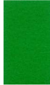
Ref. I039 - VERDE CÉSPED