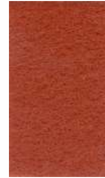
Ref. 1023 - TEJA