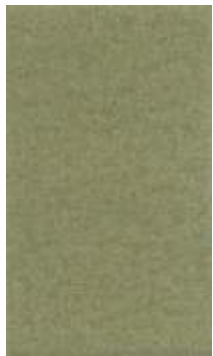
Ref. I041 - VERDE CLARO