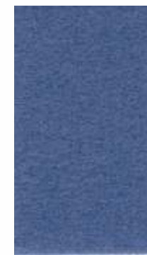
Ref. 1015 - AZUL LAVANDA