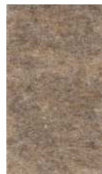
Ref. 1030 - ARENA JASPE