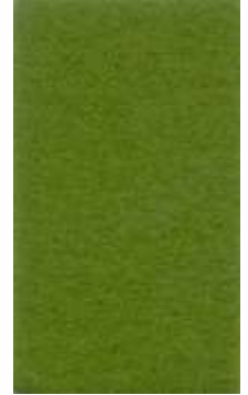
Ref. I040 - VERDE HOJA