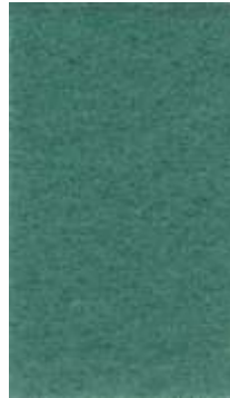
Ref. I036 - VERDE BILLAR