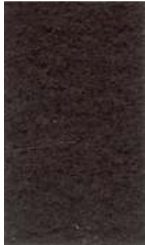
Ref. I034 - MARRÓN OSCURO