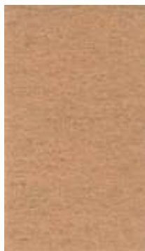
Ref. 1028 - VISON