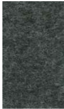
Ref. 1003 - GRIS ANTRACITA