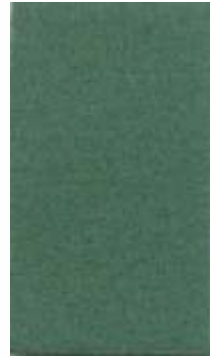
Ref. I037 - VERDE AGUA