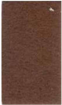
Ref. I033 - MARRÓN MEDIO