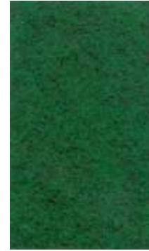
Ref. I038 - VERDE JASPE