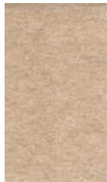
Ref. 1029 - SAHARA