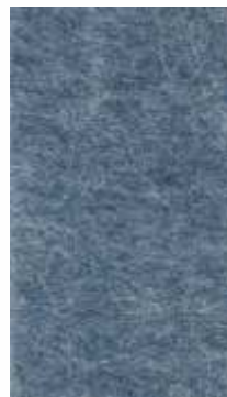
Ref. 1012 - AZUL CLARO JASPE