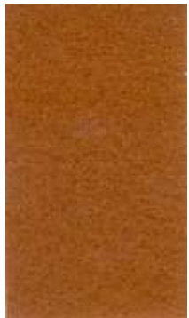
Ref. 1025 - COBRE