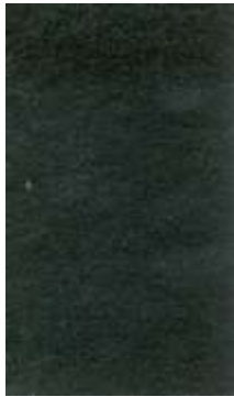
Ref. 1001 - NEGRO