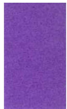
Ref. 1016 - VIOLETA