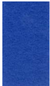
Ref. 1011 - AZUL AÑIL