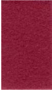
Ref. 1019 - BURDEOS