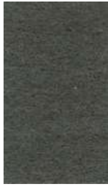
Ref. 1002 - GRIS MARENGO