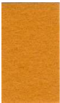
Ref. 1026 - WHISKY