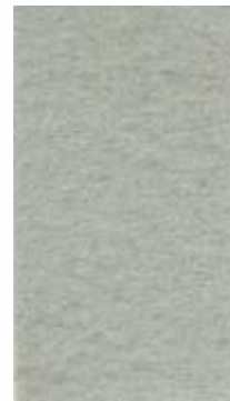
Ref. 1005 - GRIS PERLA