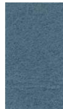
Ref. 1014 - AZUL AZAFATA