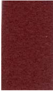
Ref. 1018 - GRANATE