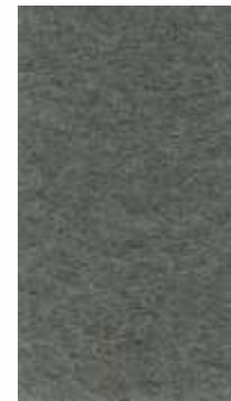
Ref. 1006 - GRIS MEDIO