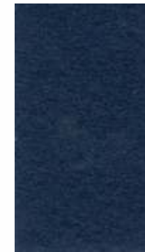
Ref. 1007 - AZUL MARINO