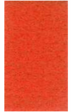
Ref. 1024 - SIENA