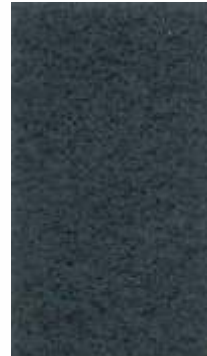
Ref. IE002 - GRIS ACERO