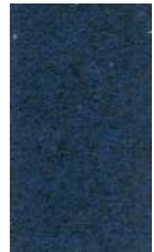
Ref. 1008 - AZUL MARINO JASPE