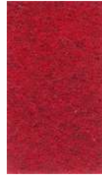
Ref. 1022 - ROJO JASPE