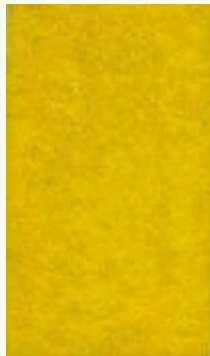
Ref. IE010 - AMARILLO