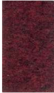
Ref. 1020 - BURDEOS JASPE