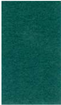
Ref. I035 - VERDE OSCURO