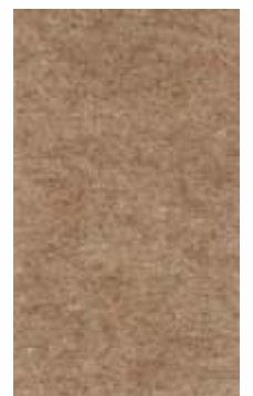
Ref. 1032 - BEIGE JASPE