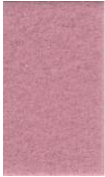
Ref. 1017 - ROSA