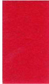
Ref. 1021 - ROJO